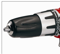
Quality chuck by Peacock