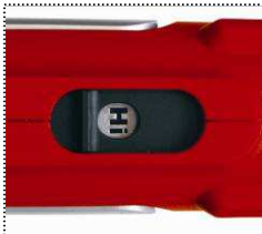
2-Gears with Auto-Lock